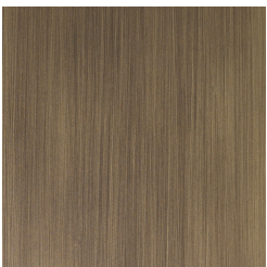
Metal Brushed Dark Bronze