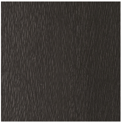
Carbalho Veneered Dyed Dark Wengé - Matt