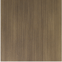
Metal Brushed Dark Bronze